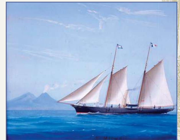
Saint-Michel III in the Bay of Naples, gouache

The sea was his main source of inspiration. From 1866, he combined writing and maritime travel. His trips aboard his own vessels, the three Saint-Michels , truly stimulated his imagination. Twenty Thousand Leagues under the Sea was partly written in the small cabin of Saint-Michel I .