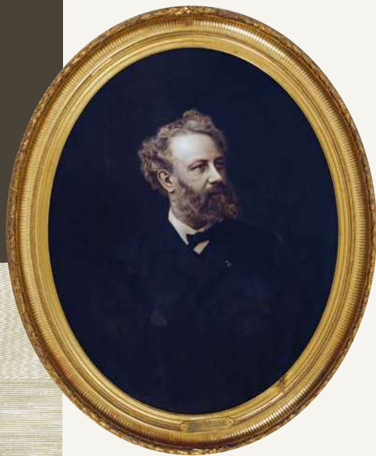
Portrait of Jules Verne, oil on canvas