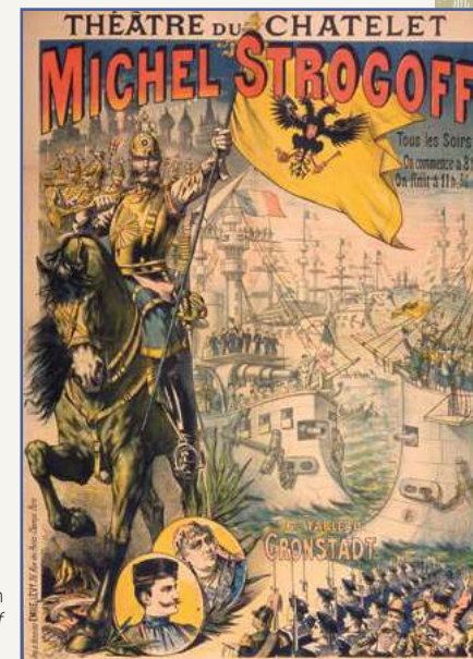
Poster for the stage adaptation of Michel Strogoff

Jules Verne wrote over thirty plays in total, yet this aspect of his writing is not well known. In fact, he found theatrical success by adapting his novels Around the World in Eighty Days , Michel Strogoff , and In Search of the Castaways for the stage. These spectacular productions, with their dazzling sets and staging, paved the way for film adaptations in the following century.