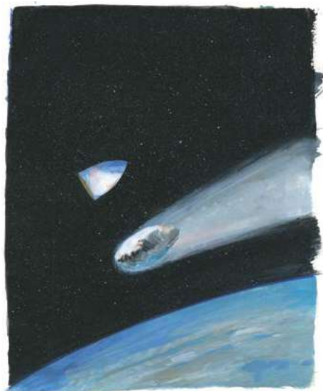
Jame's Prunier, original illustration for Around the Moon (éditions Gallimard)